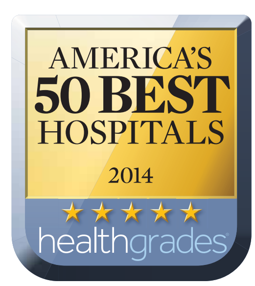
Lee Memorial Hospital HealthPark Medical Center