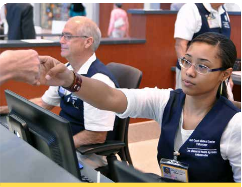
Lee Memorial Health System volunteers donated 559,895 hours, with an economic value of $12.4 million.