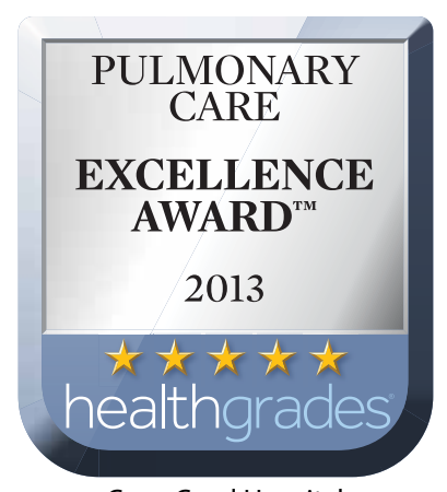
Cape Coral Hospital Ranked Top 10% in the Nation Pulmonary Care