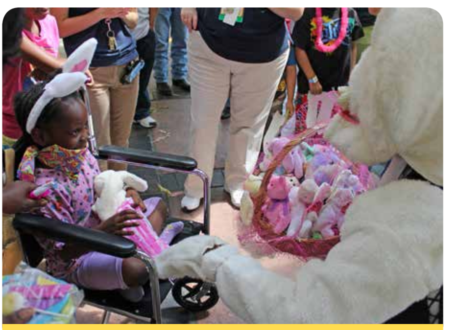
Young patients from Golisano Children's Hospital of Southwest Florida have fun meeting the Easter Bunny.

Electronic Health Record - Lee Memorial Health System began implementing Epic electronic health records (EHR) more than two years ago. Now the technology is fully functional in all system hospitals and physician offices. EHRs allow medical professionals to keep track of their patients, monitor their conditions and reduce the chance of medical errors. Physicians can view a patient's medical record from anywhere in the health system, and patients can view parts of their medical record at any time through a secure, online portal called MyChart. Epic EHR enables Lee Memorial Health System physicians and clinicians to provide the best, safest and most effective care.