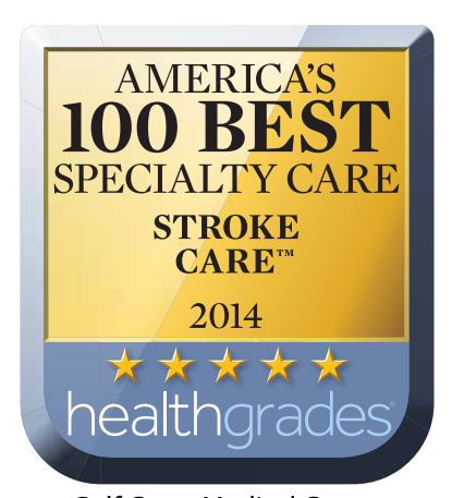
Gulf Coast Medical Center Ranked Top 5% in the Nation Stroke Care