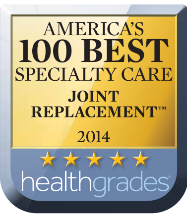
Lee Memorial Hospital Ranked Top 5% in the Nation Joint Replacement