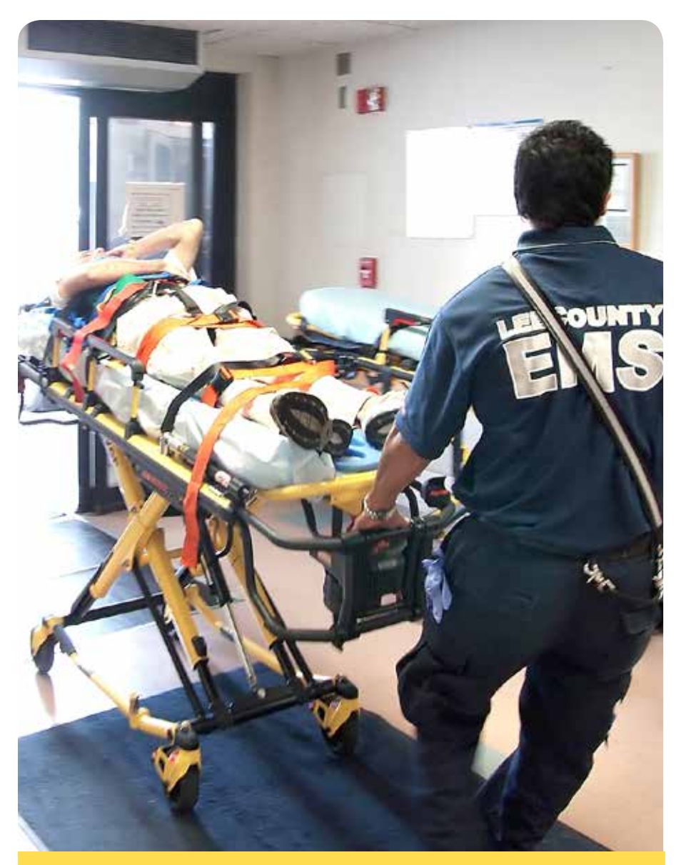
The Trauma Center provides lifesaving care 24/7 to 1,900 patients each year.

community leaders want to do more to prevent and decrease the incidence of NAS. A dedicated community task force was created in 2011 to determine strategies and solutions, and to address the problem. Since the inception of the task force and in the last year, the incidence of NAS has leveled off. The task force works to educate our community and continues to develop tactics to ensure that mothers understand the implications of drug use during pregnancy.