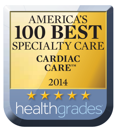
HealthPark Medical Center Ranked Top 5% in the Nation Cardiac Care