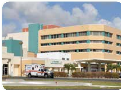
Cape Coral Hospital