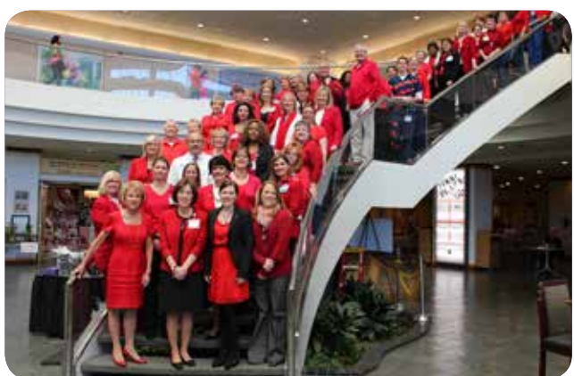
Lee Memorial Health System employees celebrate annual Wear Red Day at HealthPark Medical Center to raise awareness of heart disease.

Lee Memorial Health System supports the American Heart Association efforts through a number of programs and initiatives, including the annual Heart Ball, Wear Red Day, National Walking Day, My Heart My Life—a comprehensive platform for healthy lifestyles; and through ongoing community programs aimed at reducing the number of deaths from heart disease by 20% by 2020. This partnership includes a focus on workplace wellness through the Fit-Friendly Employer designation. More than 40 employers in Southwest Florida, including