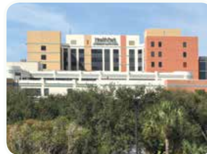
HealthPark Medical Center