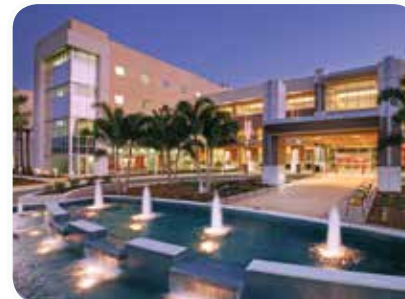
Gulf Coast Medical Center