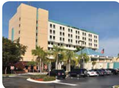
Lee Memorial Hospital