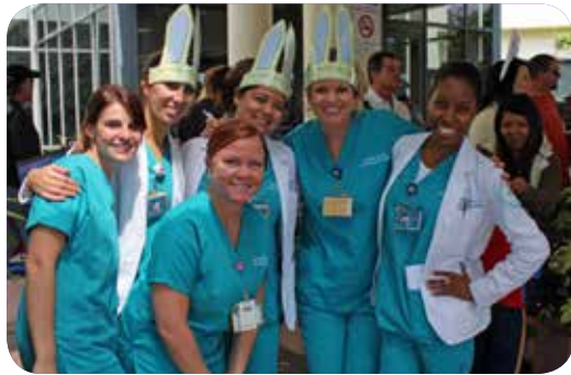
Nova Southeastern University student nurses celebrate the Easter season with patients and staff at Golisano Children's Hospital during the annual Bunny Run.

Lee Memorial Health System and Golisano Children's Hospital of Southwest Florida have supported the March of Dimes' March for Babies fundraising event for more than 15 years. We also support them through collaborative research efforts and initiatives, including the initiative to eliminate early elective deliveries before 39 weeks gestation. The partnership is a natural fit, as Golisano Children's Hospital is home to the only Level III neonatal intensive care unit (NICU) between Tampa and Miami and the Regional Perinatal Intensive Care Unit.