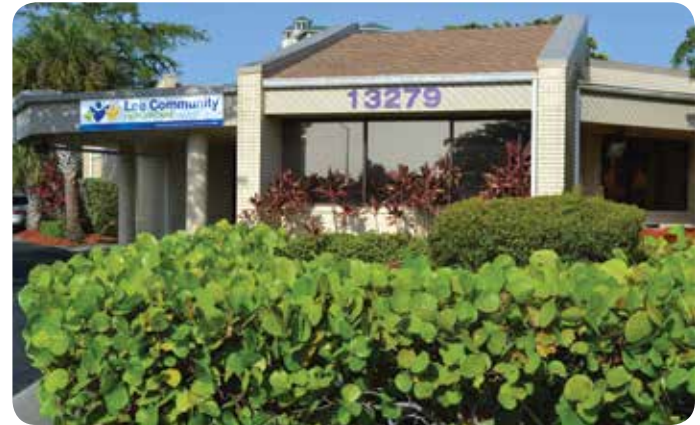
Lee Community Healthcare-North Fort Myers Clinic

The Lee Physician Group United Way House clinics, which serve a diverse population, expanded in 2014. The locations in Dunbar, North Fort