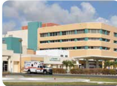
Cape Coral Hospital