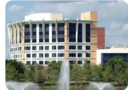
HealthPark Medical Center