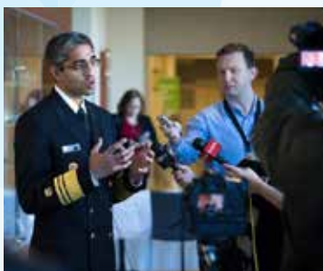
United States Surgeon General Vivek Murthy, M.D. MBA speaks with the press during his visit to Fort Myers.