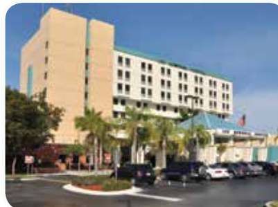
Lee Memorial Hospital